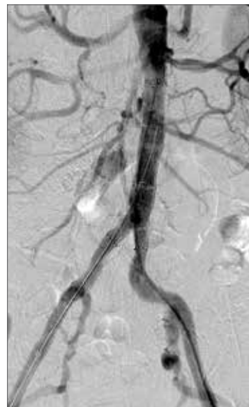
Concluding DSA check-up after stenting of the infrarenal aortic stenosis and extension into both pelvic arteries using nitinol stents