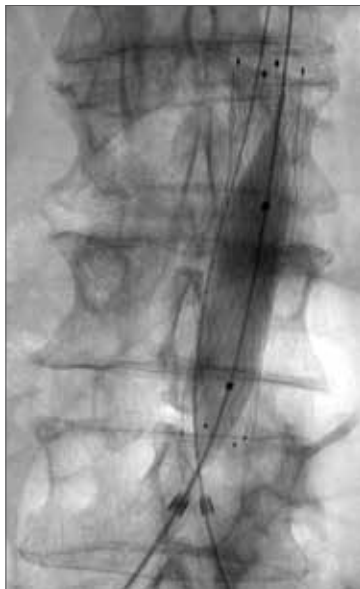
Dilation of the implanted sinus-XL with easily visible tantalum markers at the stent ends

The high-risk patient was successfully treated for major long eccentric calcified stenosis of the infrarenal abdominal aorta by the introduction of a sinus-XL Nitinol stent. No reliable data concerning the benefits of stenting compared to dilation only is available for cases of stenoses of the infrarenal aorta. Given the length of the eccentric stenosis, primary stent treatment appeared to be indicated given the anticipation of good primary technical results and lower risk of embolism.