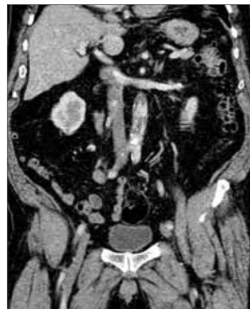
Complementary CT examination of abdominal aorta to grade the stenosis and measure the length and diameter of the vascular segment to be treated.

Under local anaesthetic: femoral introduction of a long 10 F tube on the right and 6 F tube on the left. Passage of the wire and catheter was complicated by fissured infrarenal plaques. Primary implantation of a sinus-XL Nitinol stent (22 mm / 8 cm) followed. The stent was positioned below an accessory left renal artery up to a point shortly above the aortic bifurcation, to cover all degenerated sections of the infrarenal aorta. To ensure effective iliac drainage, the aortic stent was extended bilaterally into both pelvic arteries with two 12 mm / 4 cm Nitinol stents. The aortic stent was dilated at 14 mm, the iliac stents at 10 mm. Post-intervention DSA examination showed regular expansion of the stent in the infrarenal aorta without residual stenosis or peripheral embolisms.